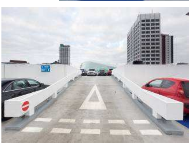
Full top deck coating & parking pads to Gade