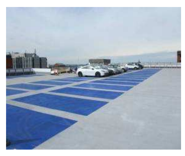
CitiPark Parking Pads Enhancement to Church and Sutton